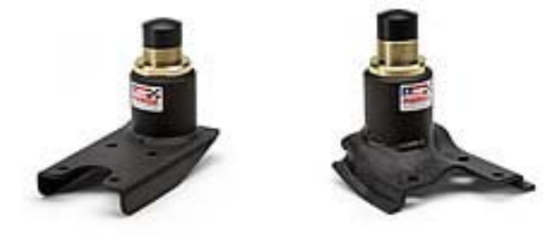
Dana & 8 3/4 adjustable snubbers $75 each